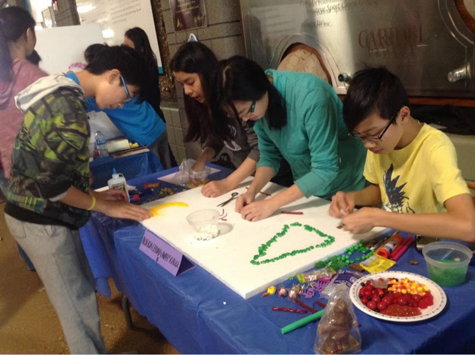
Candy Art Competition