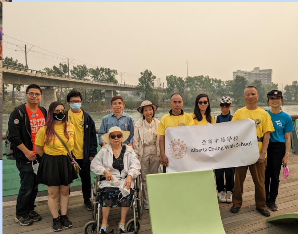
Walk-a-thon for Wing Kei Care Centre